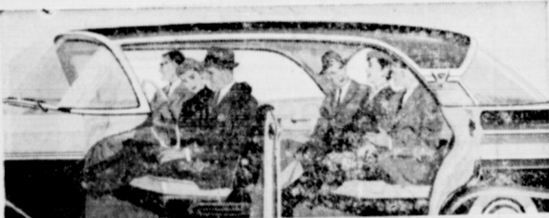
FAR BIGGER IN EVERY IMPORTANT DIMENSION. —This year Mercury has grown bigger in every important dimension. For example, there is more headroom, leg room, shoulder room, hip room.