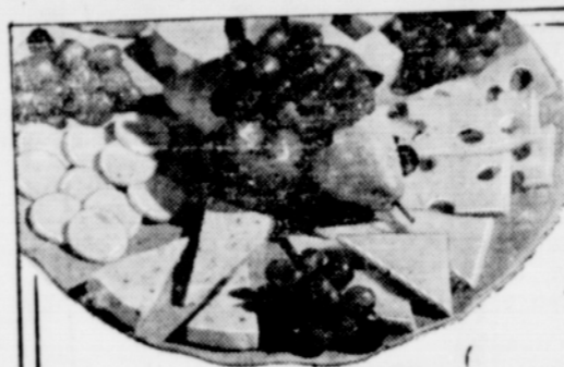
Holiday CHEESE TRAY

Libbys . . . . . 2 1/2 tin PUMPKIN . . . . . 2 for 31c