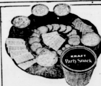
PARTY SNACK TRAY