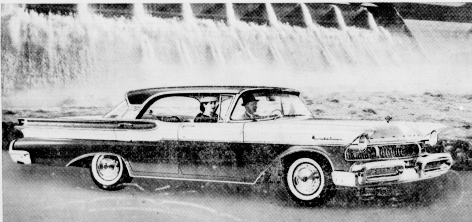
BIGGEST SIZE INCREASE IN THE INDUSTRY —Mercury is now over 17½ feet long, more than 6½ feet wide. Wheelbase is a big 122 inches. Inside there are inches more headroom, leg room—as much shoulder room, for example, as in many of the most expensive cars.