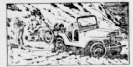
Mobile power. With power take-off, the Universal 'Jeep' provides mobile power for operating welders, compressors, generators and many other kinds of specialized equipment.