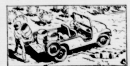
Now a 'Jeep' with longer wheelbase—the new model CJ-6. Carries larger, bulkier loads, has all the features that made the 'Jeep' famous.

A 4-Wheel-Drive Universal 'Jeep' takes you to the job, wherever it is—on the road or off! This rugged performer carries men and equipment over the highway in conventional 2-wheel drive. Then, when work calls for travel off the road—through mud, sand or snow, up hill or down—you shift a single lever for the extra traction of 4-wheel drive. With power take-off, or hydraulic lift, the Universal 'Jeep' does an almost endless variety of jobs. To find out what it can do for you, ask for a demonstration.