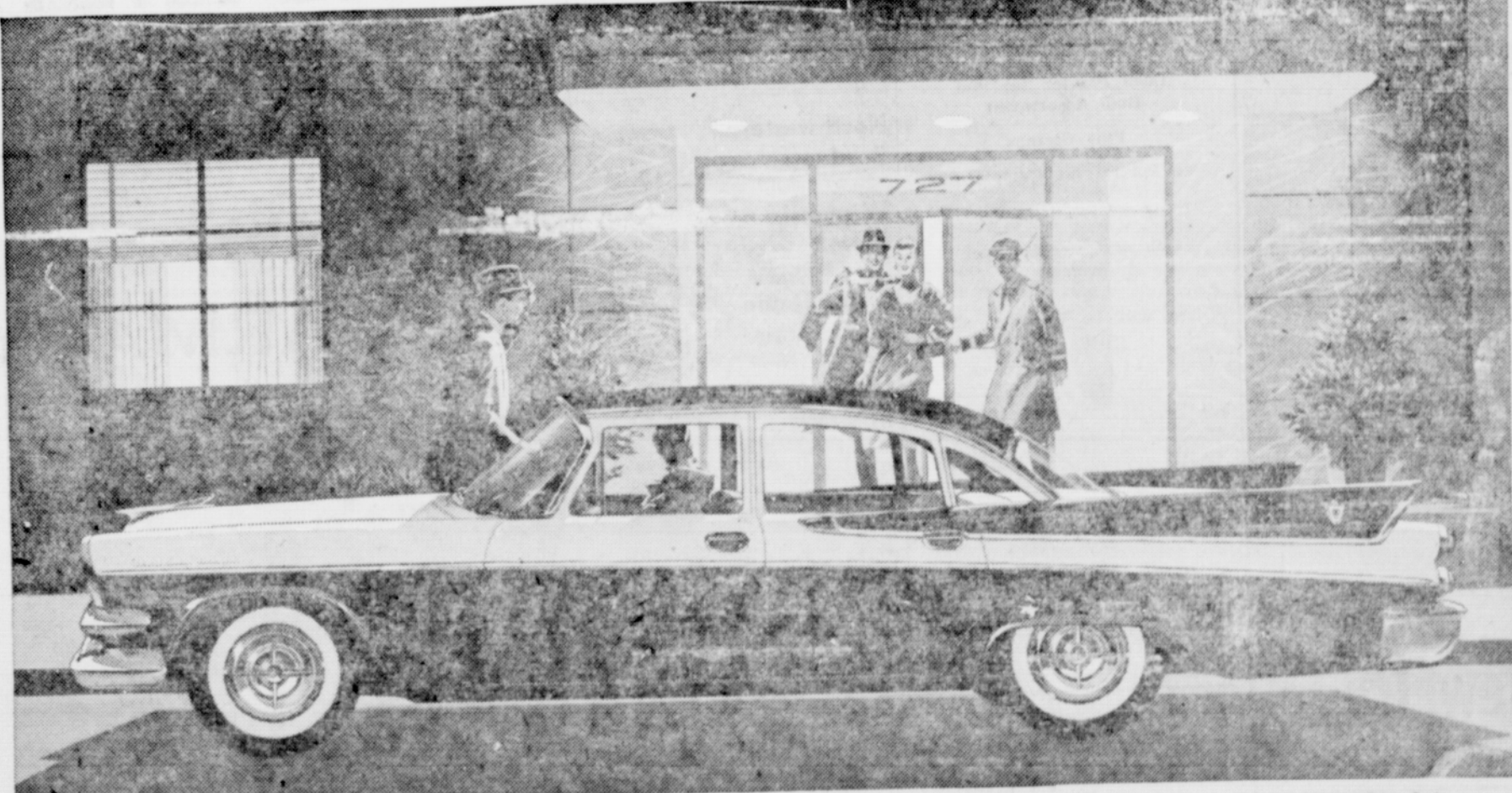
Swept-Wing '57 Dodge Custom Royal 4-Door Sedan

So I say quit worrying about the youngsters. Leave the girls to squeal at Elvis, the women to over Liberace, the men to whistle at Marilyn Monroe—and let's go on about our business.