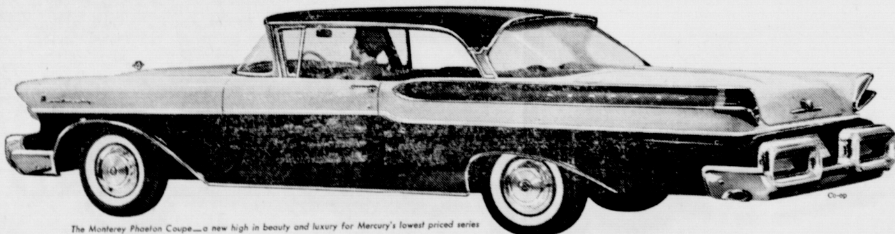
The Monterey Phaeton Coupe—a new high in beauty and luxury for Mercury's lowest priced series

Everything that counts in a car has been changed dramatically! Mercury for '57 presents: Dream-Car Design · Biggest size increase in the industry · Exclusive Floating Ride · New Keyboard Automatic Transmission Control · New 255 and 290 hp V8 engines · Exclusive Power-Booster Fan · Dream-Car features everywhere you look. Stop in—see how The Big M outdates them all.