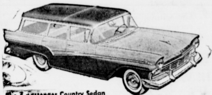
The 8-passenger Country Sedan