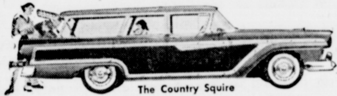
The Country Squire

Come in now—and sample this new adventure named Ford!