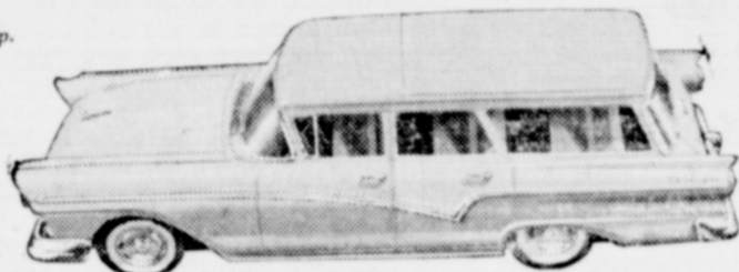
The 9-passenger Country Sedan