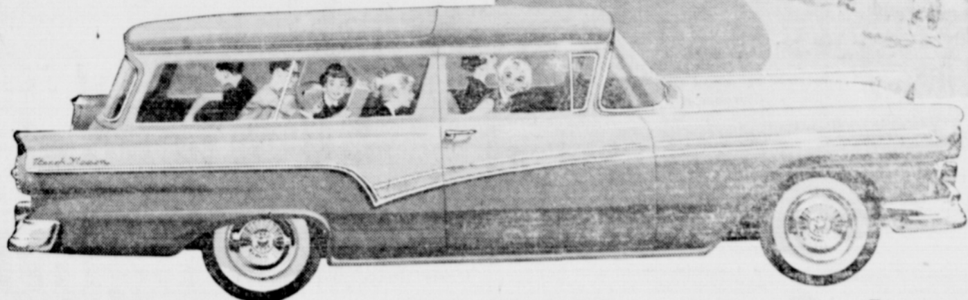
The new Del Rio Ranch Wagon