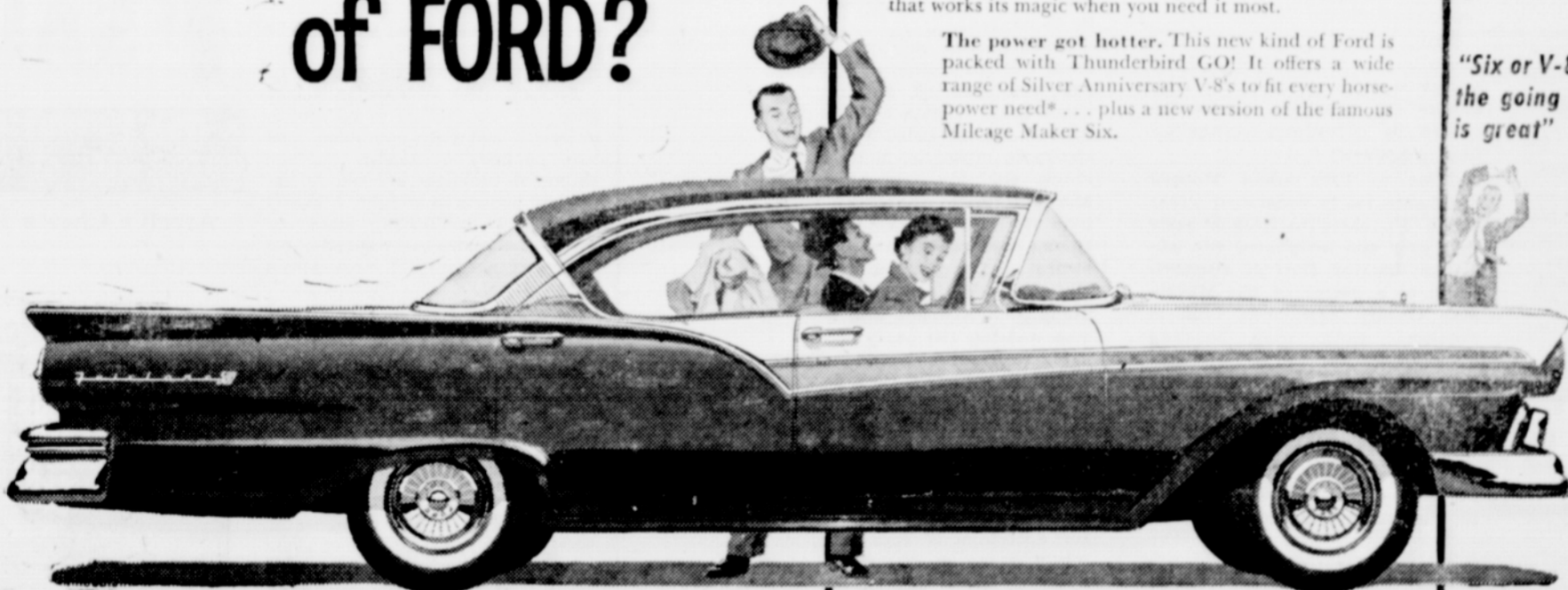
The new Ford Fairlane 500 (118-inch wheelbase). Longer, lower, larger than many medium-priced cars, yet lower in price than most of them!

The roof got lower. And it's designed to let you make the easy entries and graceful exits you've always known.