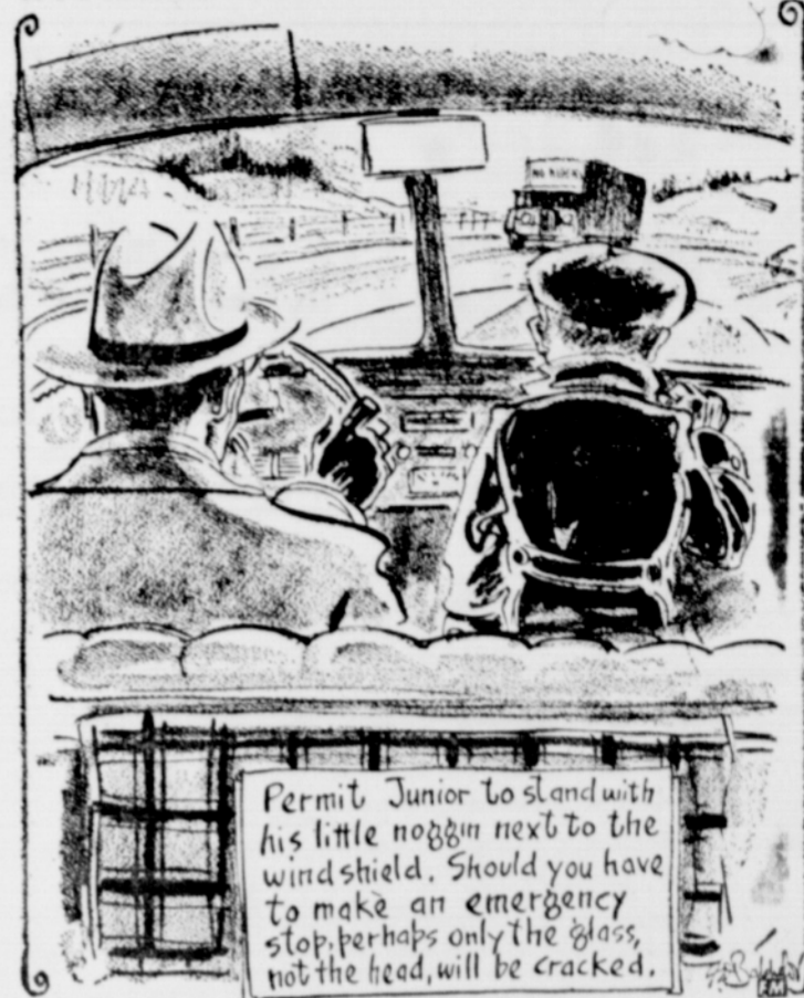
Courtesy of B. F. Goodrich Safe Driver League © 1956 by News Syndicate Co. Inc.