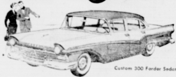
Custom 300 Fordor Sedan

In all models you have your choice of engines, either the great V-8 or one of the new Silver Anniversary Ford V-6's. You'll have no trouble choosing Ford—but you'll have trouble choosing which Ford! Six or V-8, the going is great!