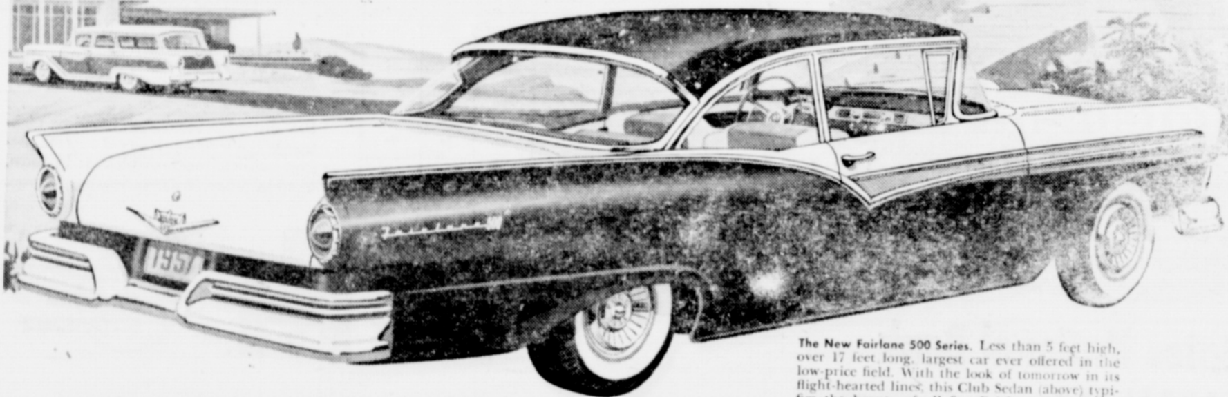
The New Fairlane 500 Series. Less than 5 feet high, over 17 feet long, largest car ever offered in the low-price field. With the look of tomorrow in its flight-hearted lines, this Club Sedan (above) typifies the beauty of all five Fairlane 500 models.

The New Ford Station Wagons. This famous line of champions has been redesigned from nameplate to tailgate. These five spacious glamour wagons are lower, longer, livelier than ever.