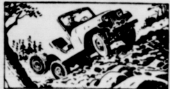
EXTRA TRACTION. With the all-wheel traction of its 4-wheel drive, the Universal 'Jeep' travels through mud, sand, soft earth.