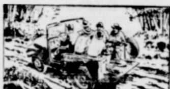
HAULING. The 'Jeep' carries up to a half-ton of cargo or up to seven passengers. Takes tools, equipment and workers wherever you need to go.