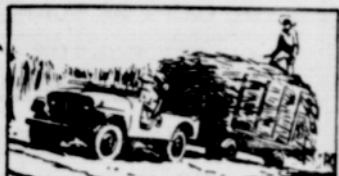
TOWING. Towing heavily-loaded trailers—on or off the road—is easy for the 'Jeep', with the extra traction of its 4-wheel drive and low gear range.