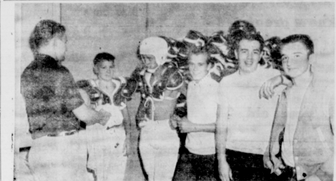
OUT FOR UNIFORMS. A momentous occasion Saturday was the issuing of football uniforms. About 20-30 boys were given uniforms, while more are expected before school starts. Many of the youngsters had never had on a suit before.