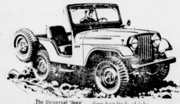
The Universal 'Jeep'... does hundreds of jobs.

BUFFINGTON MOTOR CO. 185 S. Ellensburg Ave. —Gold Beach, Ore.