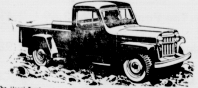
The 'Jeep' Truck... America's lowest-priced 4-wheel drive truck.