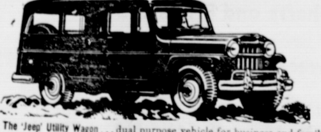
The 'Jeep' Utility Wagon... dual purpose vehicle for business and family.

MCCLENDON MOTOR CO. Crescent City, California