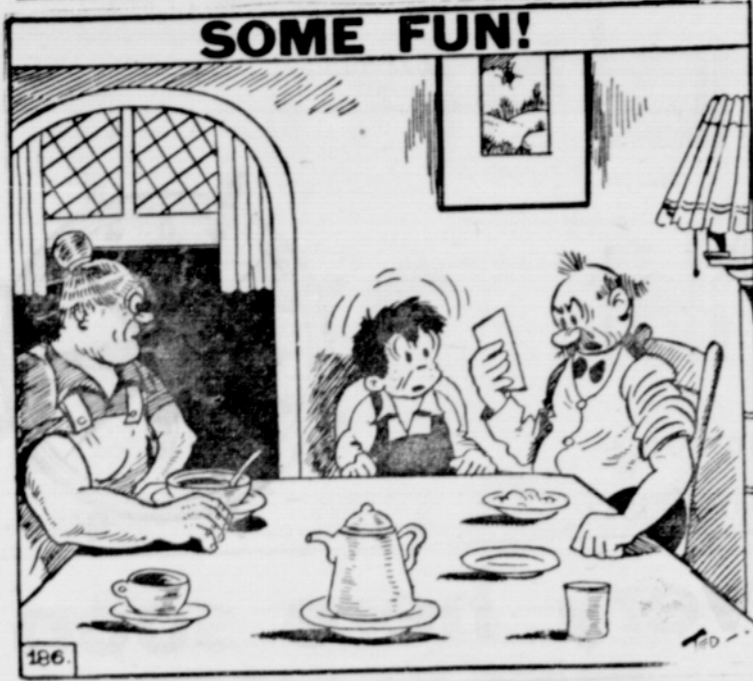
"TOO BAD THE BOARD OF EDUCATION DOESN'T GIVE MARKS FOR WINDOW-BREAKING!"