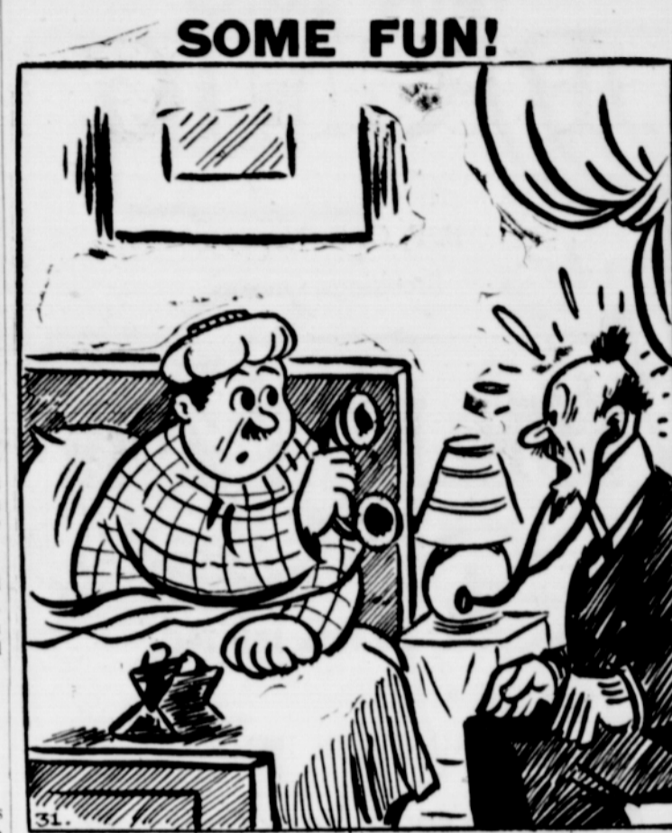
"IT'S YOUR SECRETARY, DR. JONES. SHE SAYS IT'S TIME FOR YOU TO TAKE YOUR PILLS."

There's a definite movement on foot, in Oregon, for the publication of the names of juvenile violators of the law and the names of their parents. Tried out in other states it has proven a deterrent to criminal acts and placed responsibility on the elders.