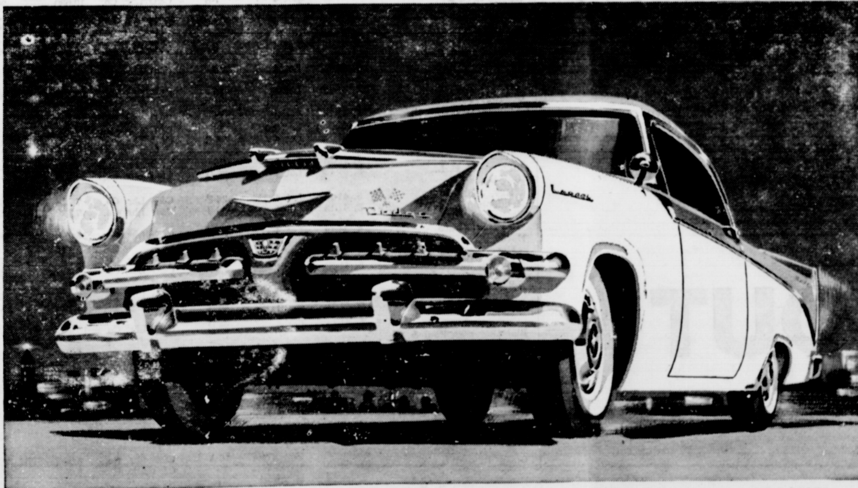
YOU RULE THE ROAD IN A '56 DODGE!

In the past two years Oregon's chromite mines, which number near forty, have done nearly 500,000 dollars worth of business. Dole also reports that for some sections of southwestern and central Oregon the economy is dependent upon the chrome industry