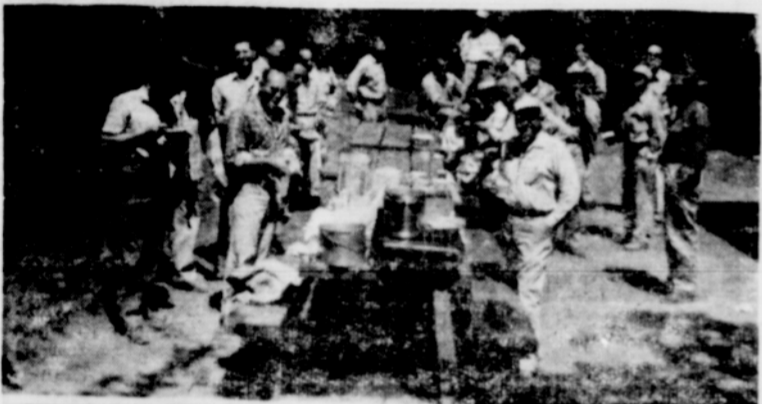
SOIL CONSERVATION MEN gather at Azalea Park for chow. A group of soil and woodland men from all over the west, including Washington, Oregon, California, Idaho, and Arizona made an extensive tour of this region last week. The workshop, held each year, brought more than 20 SCS officials to Curry county. They drove to Carpenterville, up the Long Ridge Road, as well as eating in the park.