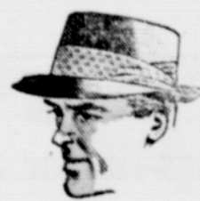
SUMMER STRAWS $2.98