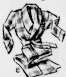
TERRY CLOTH ROBES for relaxation.