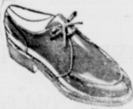
Famous WEYENBERG Massagic Air Cushion SHOES Many Styles to choose from $17.95