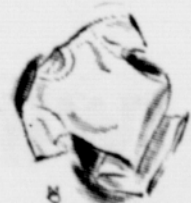
WHITE T-SHIRTS Combed Cotton from 69¢ to $1.50