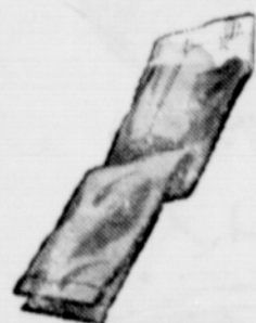
The Finest in DAY'S SLACKS. from $9.95 up