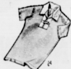
Short Sleeve . . . SPORT SHIRTS in the latest styles and patterns. from $2.98 up