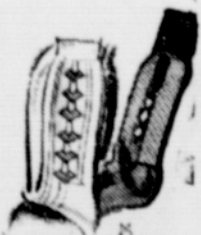
A Gala Array of Colors Interwoven Cotton ARGYLES $1.00

for practical gift . . . "CANT BUST EM" WORK CLOTHES from