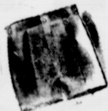
ENJOY THE SUMMER SUN! Swim Suits for Dad 'n' Lad