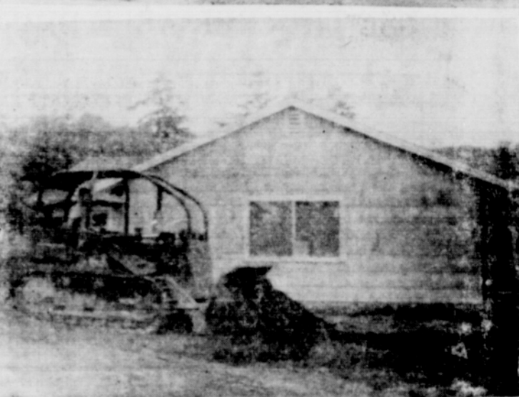
THE NEW CATE BUILDING in North Brookings is going up rapidly now. It is being built adjacent to the Western Auto Store, with the construction work done by Horton and Son. Below, is the Brookings Library grounds, in the process of being leveled for landscaping. A piece of equipment from the Brookings Red-E-Mix Co. is being used.