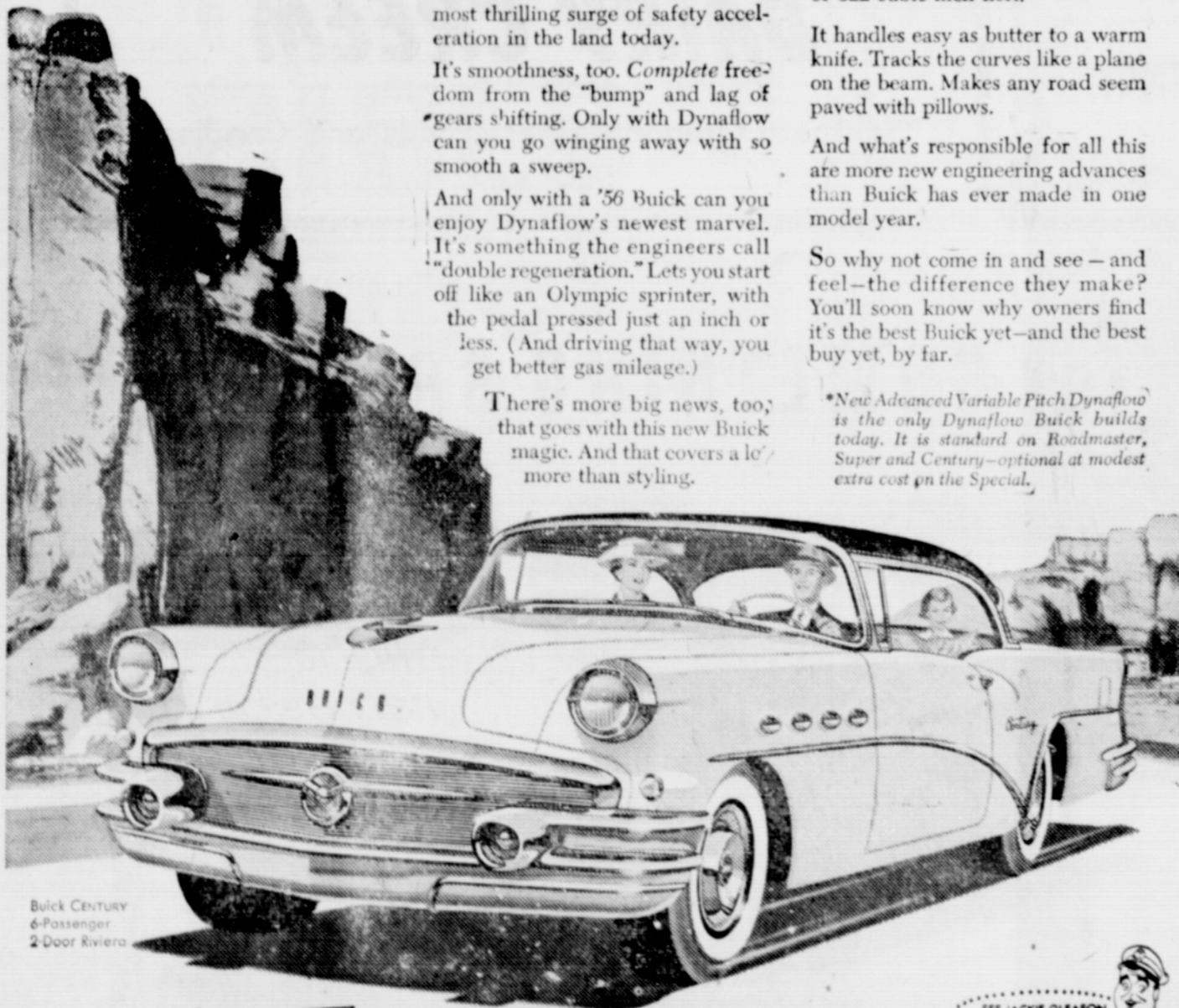
Buick Century 6-Passenger 2-Door Riviera

You'll see when you try Buick's new Variable Pitch Dynaflow!