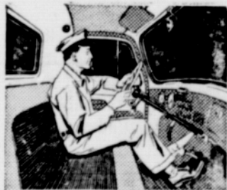
Ride in style and comfort too! Comfort-angled steering. Low hood for clear view ahead. "Quietride" roof lining, draft-free door seats. Solid and two-tone exteriors. Optional deluxe cabs have color-keyed interior, chrome trim.

Come on in first chance you get, and see the truck built to save you the BIG money on your job.