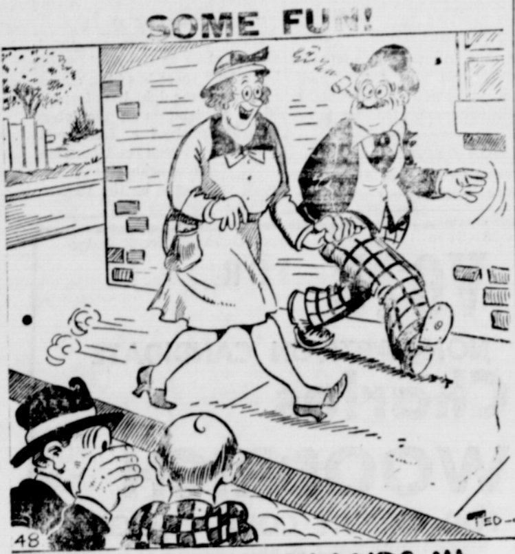
"THEY ALWAYS HOLD HANDS IN PUBLIC TO AVOID SOCKIN' EACH OTHER"