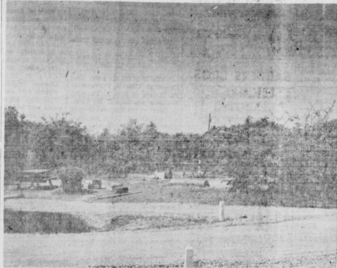
A PICNIC GROUND and CAMPSITE are some of the best features of the park. Trail sites are available, although crowded during most of the summer.