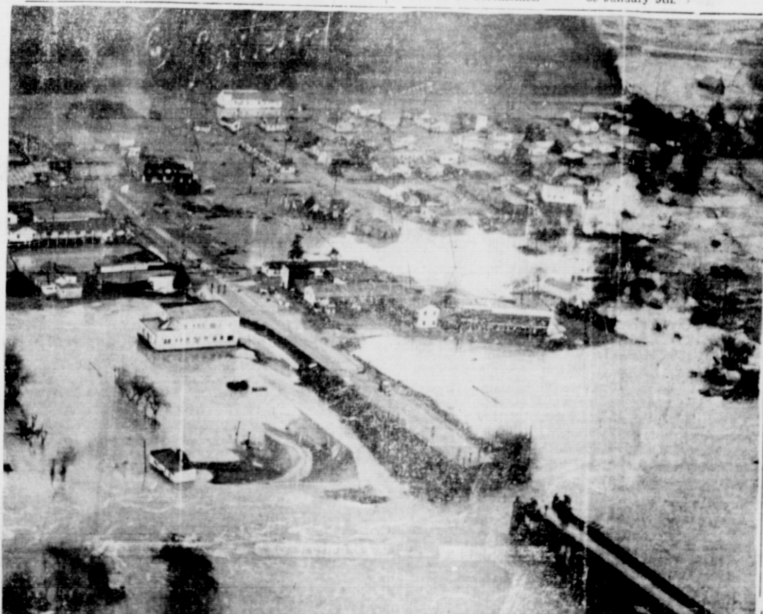
FLOOD HAVOC IN KLAMATH is shown in the above photo, taken by the Del Norte Triplette from the air. Virtually all of the town's upper side of main street is gone in the greatest destruction ever to hit the community. The gap in the highway at the north end of the bridge was filled temporarily, permitted travel. -Courtesy of the Del Norte Triplette

The Brookings-Harbor schools are getting a going over during the holidays. Complete cleaning of the buildings is underway, and the custodians are working full time. Some plumbing repairs are also being made. Men are adding a sink in the shop, and adding a three-compartment sink in the snack bar area.