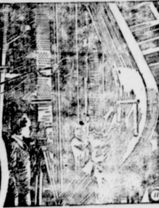
THE SEARCH FOR NEW AND MORE EFFICIENT USES OF WOOD GOES ON—ADDING PROFITS TO THE PRACTICE OF GOOD FORESTRY.