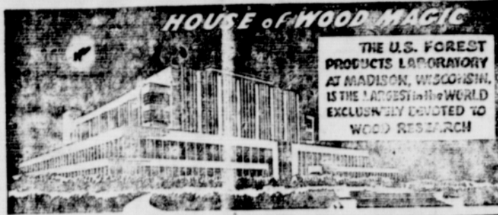
THE U.S. FOREST PRODUCTS LABORATORY AT MADISON, WISCONSIN, IS THE LARGEST IN THE WORLD EXCLUSIVELY DEVOTED TO WOOD RESEARCH!