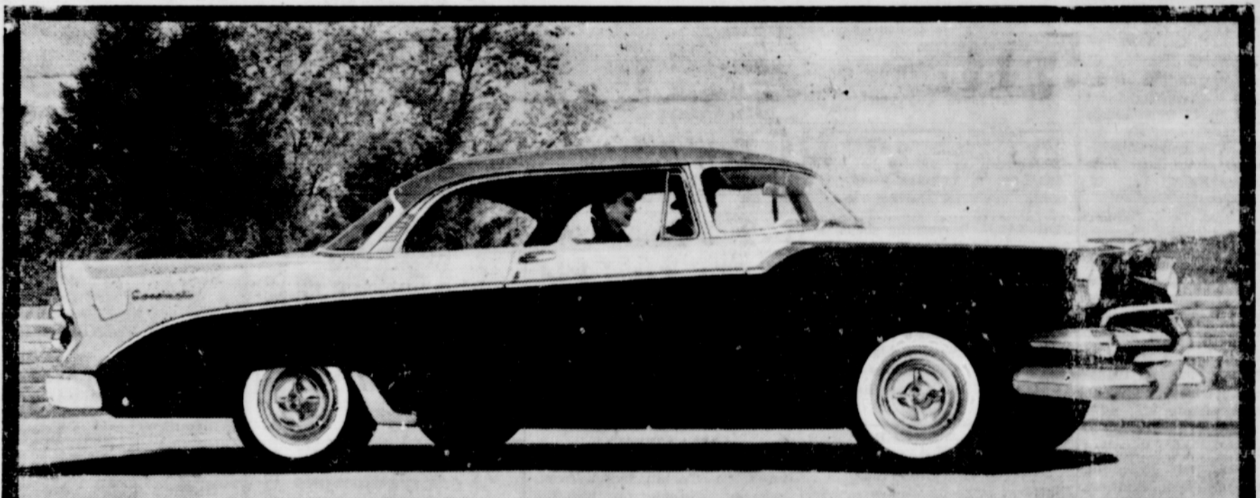
Dodge Coronet . . . the only full-size, full-styled, full-powered car to invade the low price field.