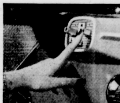
The Magic Touch of Tomorrow! Dodge push-button driving gives safer, surer, more positive control... new fingertip ease.