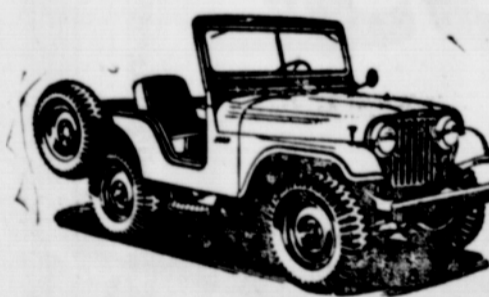
The Universal 'Jeep'... does hundreds of jobs.