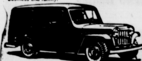
The 'Jeep' Sedan Delivery... ideal for delivery or service use.

BUFFINGTON MOTOR CO — Curry County's Only Authorized GMC Dealer — 185 S. ELLENSBURG AVENUE GOLD BEACH, OREGON