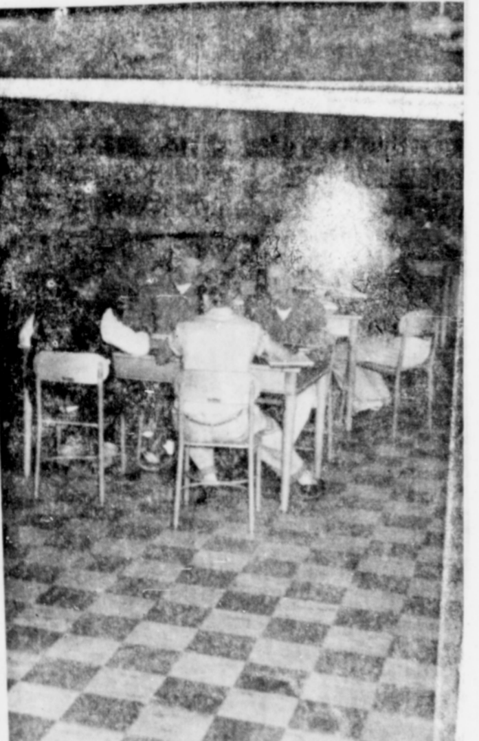
THE NEW LIBRARY is a welcome addition to the community. The entire building, cost over $300,000, and with fixtures and furnishings the total runs to over $400,000.