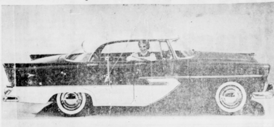
Belvedere four-door hardtop is an entirely new model introduced by Plymouth in its 1956 line of cars. Aerodynamic styling, push button driving and powerful new 134-horsepower engine are among outstanding features. Safety door latches and other safety items are standard equipment.