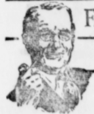
From where I sit... by Joe Marsh

a bit to cogitate upon the consummate artistry of the many, many people in many, many vocations who fretted over that bit of paper from the time of its conception to its destined use. If a side issue is placing it in your collection and brings you enjoyment and a different outlook, you and your collection's admirers will have added to its value.