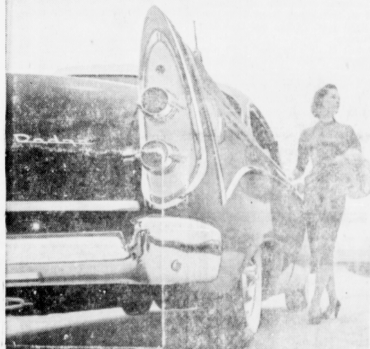
Born of Success to Challenge the Future! The Dramatic New '56 Dodge.