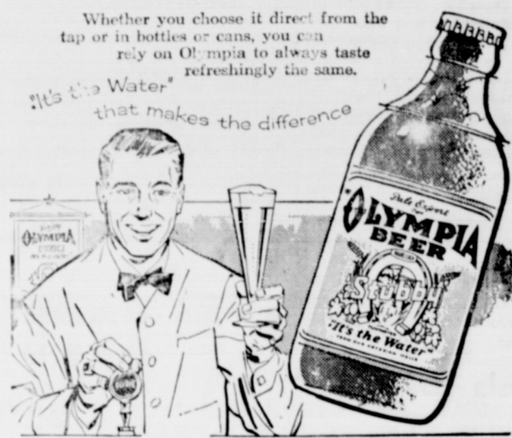
OLYMPIA BREWING COMPANY, Olympia, Wash. U. S. A. *8

Whether you choose it direct from the tap or in bottles or cans, you can rely on Olympia to always taste refreshingly the same.