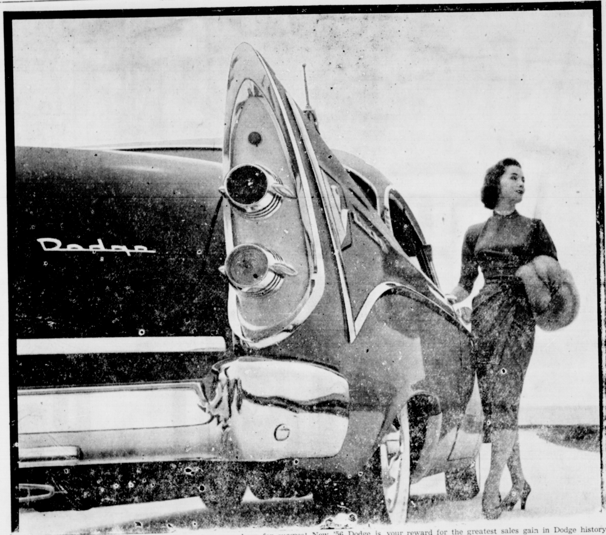
Born of success—born for success! New '56 Dodge is your reward for the greatest sales gain in Dodge history.