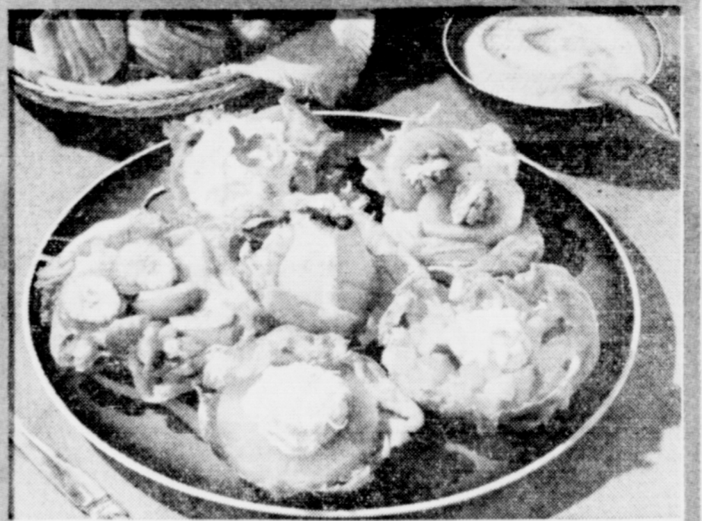
ASSORTED FRUIT SALADS FOR ELEGANT EATING

Tomato Corn Chowder: Cook 2 slices bacon, diced, with 1/4 cup grated onion until bacon is crisp. Add 2 cups cubed, raw potatoes, 1 cup water, 1 1/2 teaspoon salt, and 1/2 teaspoon pepper. Cover and simmer about 30 minutes or until potatoes are tender. Add 2 cups Libby's Tomato Juice, and 4 tablespoons flour dissolved in 1/2 cup milk. Cook over low heat, stirring occasionally, until chowder is slightly thickened. Makes 1 1/2 quarts or 6 generous servings.