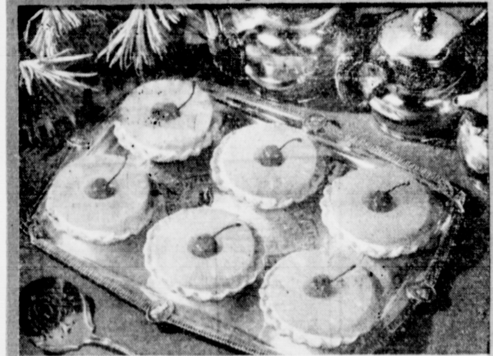
PINEAPPLE TARTS—A FESTIVE PARTY DESSERT

Remove both ends from the can of hash; push contents out in one piece. Cut into slices. "Rough" tops with tines of a fork. Broil 3 inches from the source of heat for about 8 minutes. Combine eggs and white sauce; heat. Serve with hash patties along with toasted English muffins and tart jelly. 4 servings.