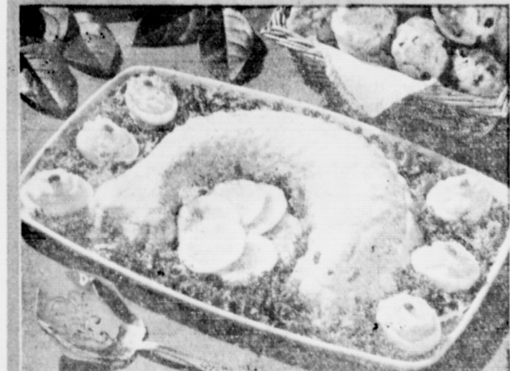
FOR APPEALING LENTEN MEALS—SERVE SALMON!

PINEAPPLE LIME TARTS 1 No. 2 1/2 can sliced Libby's Hawaiian Pineapple 1 package lime-flavored gelatin 1/2 cup whipping cream 6 baked and cooled pastry shells Drain pineapple; cover and refrigerate. Add enough water to stir to make 1 1/2 cups liquid. Heat and dissolve gelatin in it. Chill until slightly thickened. Whip cream until stiff and fold into gelatin. Fill tart shells. Chill. Just before serving, top with a pineapple slice and garnish with a maraschino cherry. 6 servings.