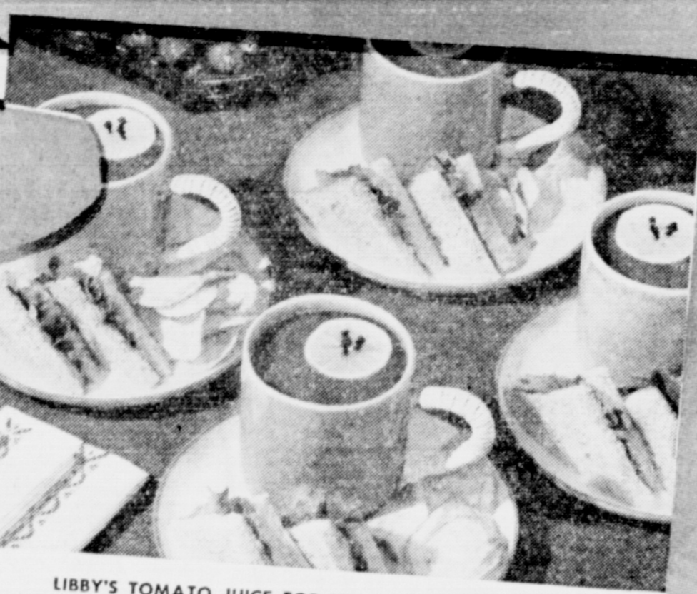
LIBBY'S TOMATO JUICE FOR HEART-WARMING SNACKS

"Hot 'n hearty," this rich, full-bodied Libby's Tomato Juice is a wonderful pick up for many occasions. Good on a brisk morning, fine for after school, and ideal for an evening party served as we have pictured, with Libby's Deviled Ham sandwiches. Or, you could serve this same juice steaming hot in bouillon cups as a first course, or in soup bowls as the favorite garnishes for hot juices are: a slice of whipped cream; a generous spoonful of Stuffed Olive; a sprinkling of chopped chives; a few pieces of popcorn. Or, try conversation passing steaming mugs of juice, add a short stalk of crisp celery with a few leaves left at the top.