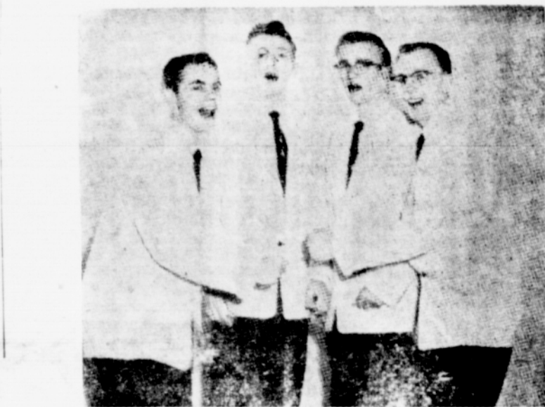
The Sharp Four, a high school quartet from Eugene, Oregon will be one of the quartets here Saturday night at the Cavalcade of Harmony Show. The group are one of the top quartets of the state.

A Cub Scout Pack meeting will be held at 7:30 p.m. at the VFW hall Friday night. Prizes will be awarded at that time on the recent soap sale held there, in which 60 cases of soap were sold. A small party for the boys will be held, following the meeting. The group wish to thank the public for their support in the drive.