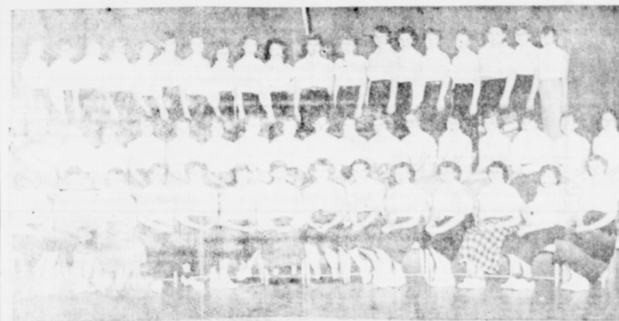
ABOVE IS THE BROOKINGS-HARBOR high school band, and chorus, who will play and sing in the Spring Concert set for this Friday, April 22 in the new high school gym. The band are shown with their new uniforms.