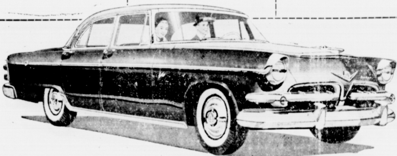
New Dodge Custom Royal 4-Door Sedan

What's it like to take command of a car up to 9 inches longer than competition? What's it like to get Dodge dependability teamed with flair-fashioned beauty?