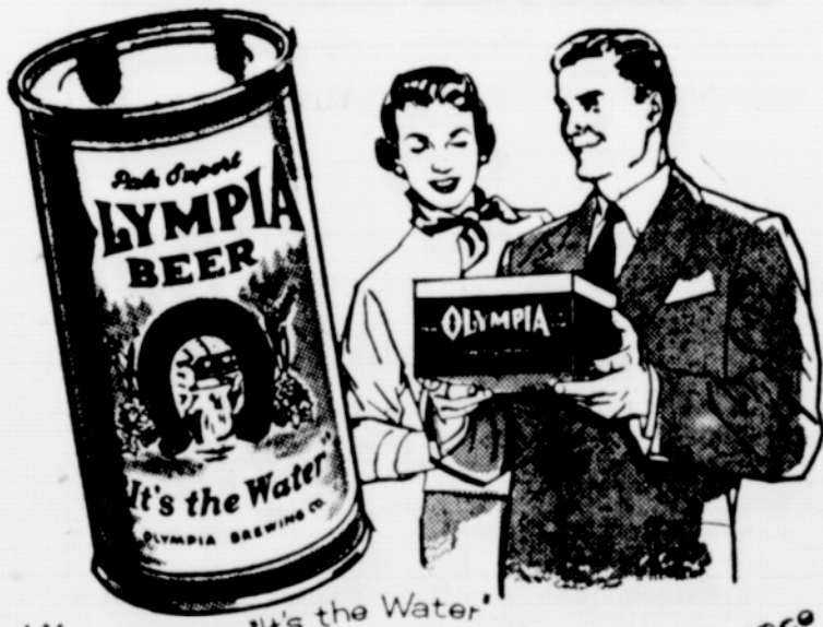
A-16 "It's the Water" that makes the difference OLYMPIA BREWING COMPANY, Olympia, Wash. U. S. A. '55

There's a pack of pleasure in every handy carton of refreshing Olympia Beer. Be sure to bring home enough!