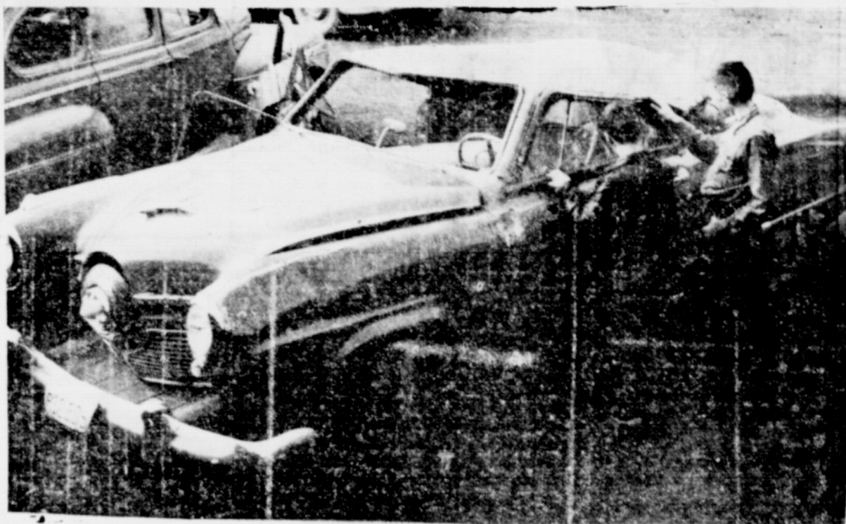
SHOWN IS THE VEHICLE in which Bobbie Dimmick was hurt in an accident Sunday night on Highway 101. The car slid and skidded about 100 feet, turned over four times before coming to a stop. Driver of the car Doug Hammes wasn't hurt, but Dimmick was tossed out on the road.