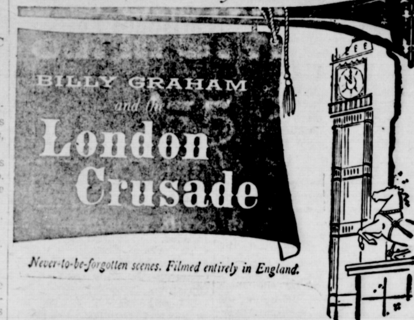
Never-to-be-forgotten scenes. Filmed entirely in England.

BROOKINGS BIBLE CHURCH Monday, Dec. 20th 8:00 p. m.