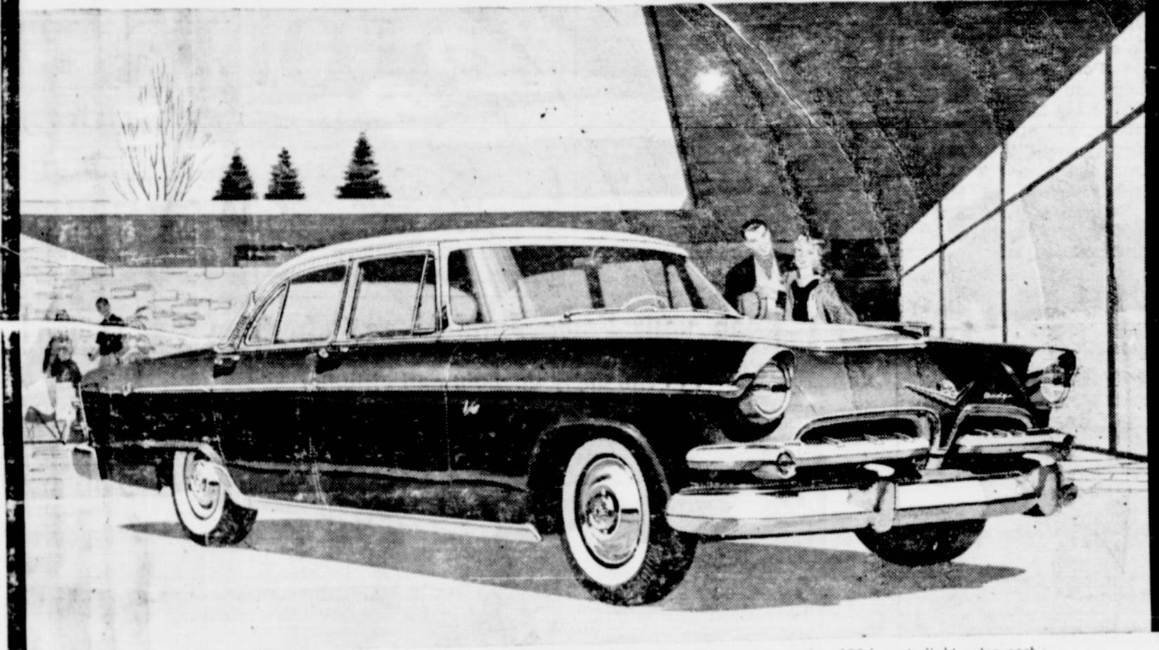
New Dodge Custom Royal V-8 4-Door Sedan with 183-hp. Super Red Ram V-8 Engine—Extra-Powered to 193-hp. at slight extra cost.