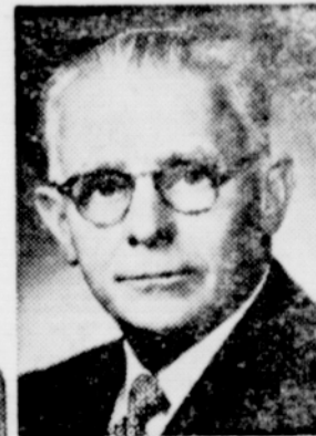
Senator GUY CORDON for United States Senator