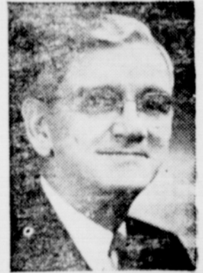
Governor PAUL PATTERSON for Governor