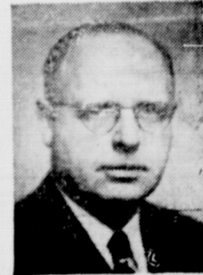
Congressman HARRIS ELLSWORTH for U. S. Congress