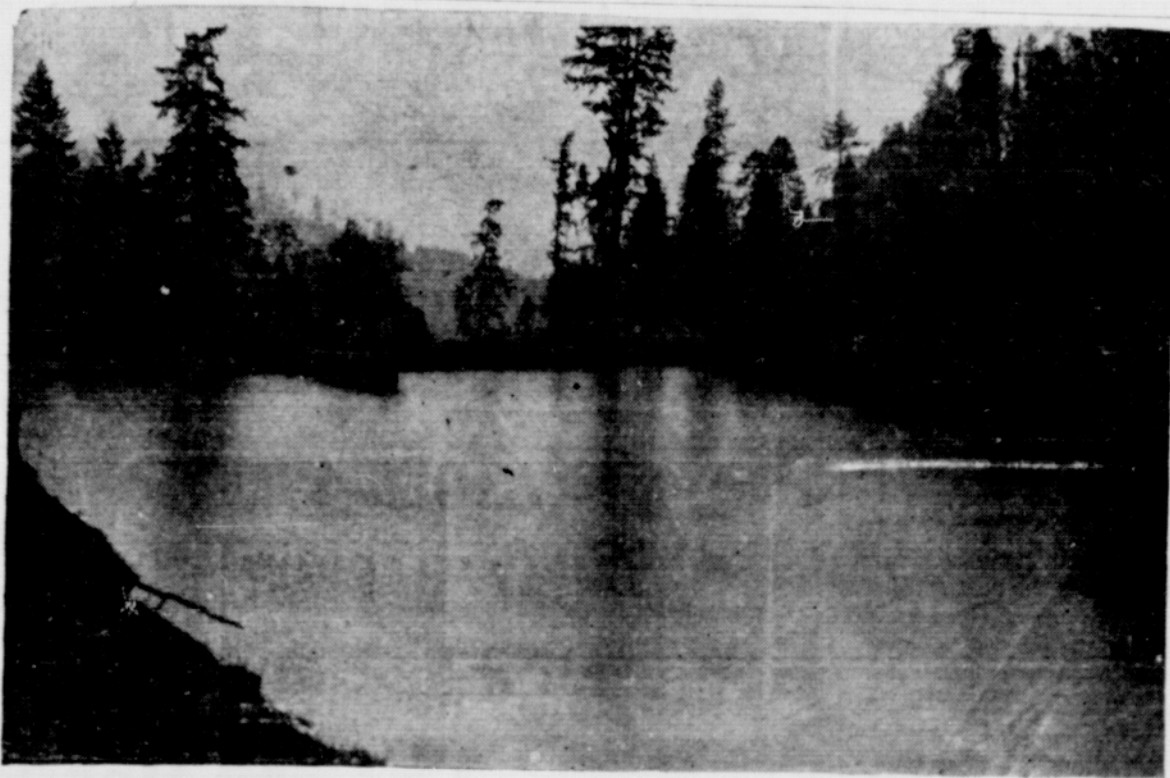
THE NEW BROOKINGS WATER COMPANY RESERVOIR is pictured above, having been in operation most of the summer. The big reservoir was four years in construction, and holds 21,000,000 gallons of water. The deepest point in the reservoir is 35 feet, and it is 1200 feet long, and varies in width from 50 feet to 300 feet. It is 382 feet above sea level.