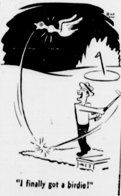
"I finally got a birdie!"

Children should be kept away from the medicine cabinet for they may try some pleasant-tasting remedy not meant for them. Poisonous preparations should be put in a separate container, out of reach, and a safe disposal unit for razor blades and other waste matter should be available. These simple measures, along with the advice of your druggist, can produce a medicine cabinet that the whole family will appreciate.