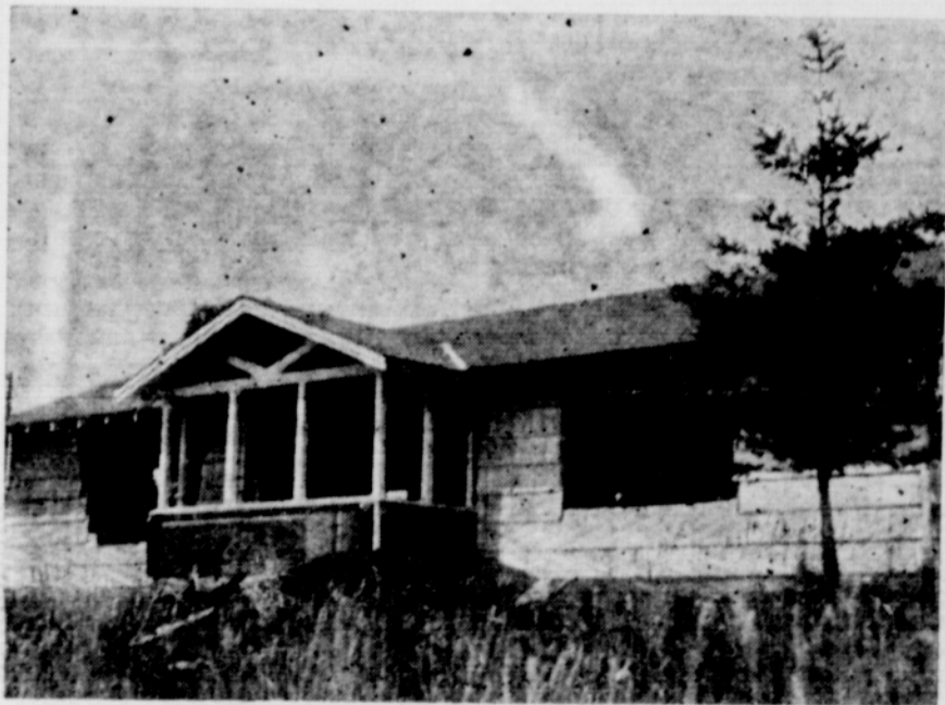
WORK IS PROGRESSING slowly on the new library building under construction in Brookings by members of the library association, and others interested in seeing that the city has a library. The land was given to the association by the Federal government, and will in turn be deeded over to the city. Almost all of the work done thus far was done on a volunteer basis by members of the association.