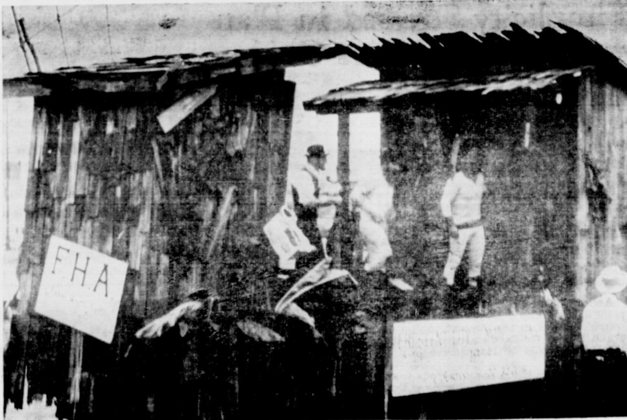
INTRIPID FRONTIERSMEN —Winning the Centennial committee prize of $150 in the American Legion sponsored parade in Fourth of July in Crescent City is the 20-30 Club float "Crescent City Model Home, 1854". The entries of this crew of sourdoughs caused an hilarious uproar among the spectators.