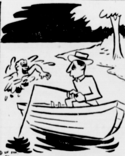
"How're they biting?"