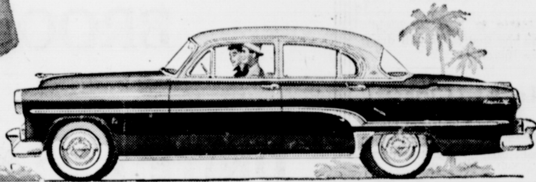
Dodge Royal V-8 4-door Sedan

PLUS... All expenses, hotels, meals, transportation