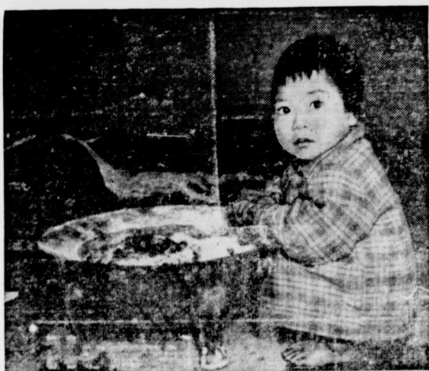
A tiny Korean waif warms his freezing hands over a kettle of burning coals. American Relief for Korea's clothing drives are securing warm garments for such war victims. ARK is financed by United Defense Fund through Community Chests or United Funds.