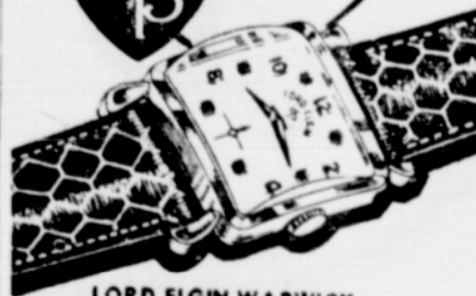
LORD ELGIN WARWICK. Superb 21 jewel accuracy.

Gifts from the Heart with Guaranteed DURA-POWER MAINSPRING ... the Heart that Never Breaks