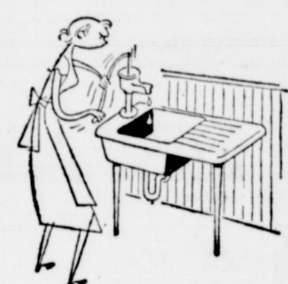
Two out of five want new sinks . . .